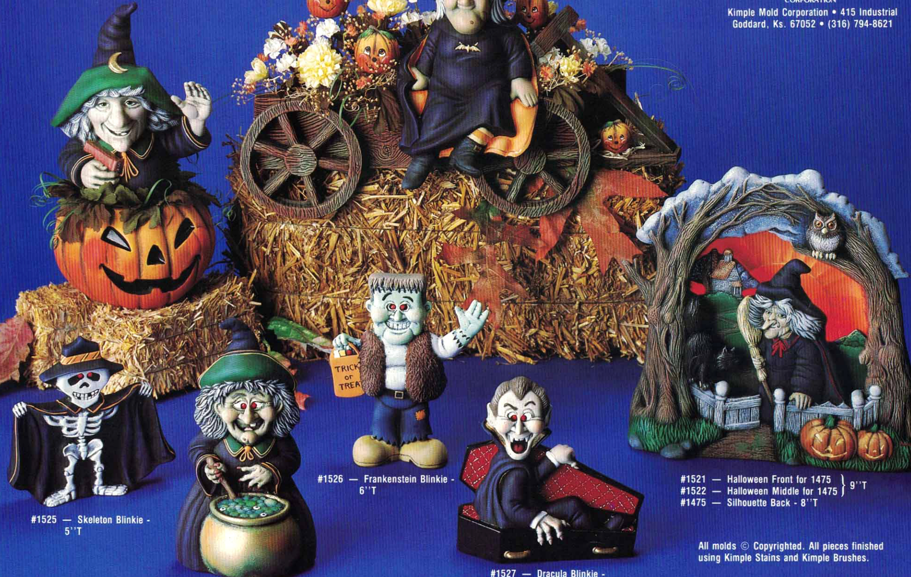
#1525 — Skeleton Blinkie - 5''T

Kimple Mold Corporation • 415 Industrial Goddard, Ks. 67052 • (316) 794-8621