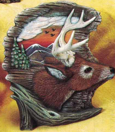
E #2163 Carved Deer/Mountain } 10"t. #2164 Acc. for 2163