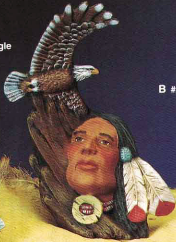
B #2160 Buffalo Hunt 9"t.