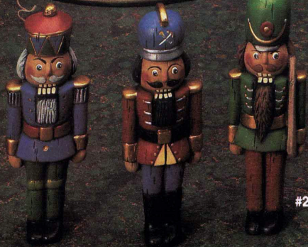
#2239 3 Nutcrackers for 2236 6 1/4"t.