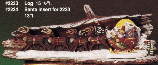
#2233 Log 15 1/2"l. #2234 Santa Insert for 2233 13"l.