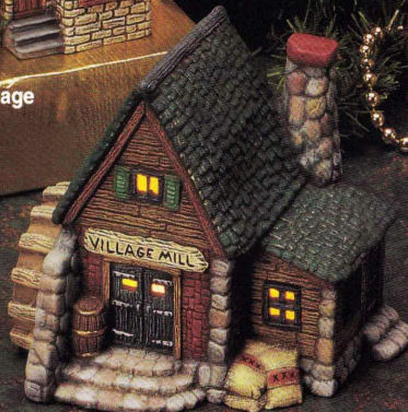
#2245 Village Mill } 5 1/2"t. #2246 Acc. for 2245