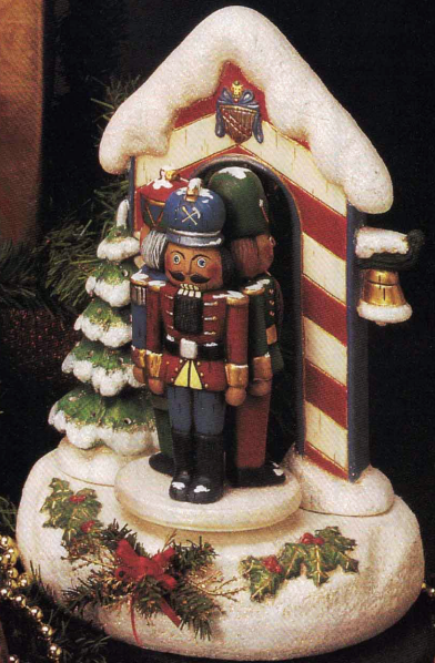
#2236 Guardhouse } 10 1/2"t. #2237 Base for 2236 #2238 Disk for 2236 #2239 3 Nutcrackers for 2236 6 1/4"t.