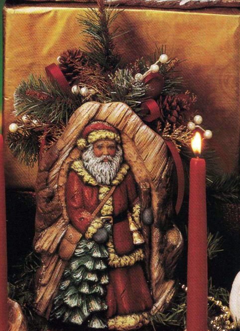
#2240 Old World Santa Planter 10"t.