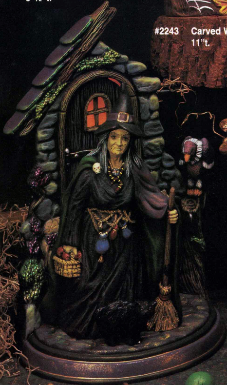
#2243 Carved Witch Stump 11"t.