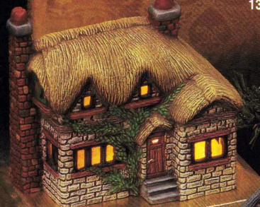
#2244 Village Cottage 5 1/2"t.