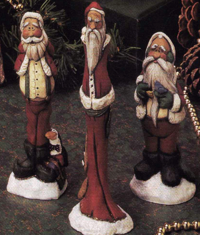
#2249 "Jolly" Santa (2) 7"t. #2250 "Grumpy" Santa (2) 8"t. #2251 "Friendly" Santa (2) 6"t.